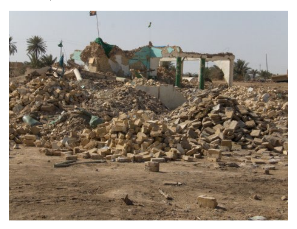
Shia Holy Shrine in Khidr – completely destroyed by Al Qaeda in December 2008

Primary action for the week was trip to Khidr area, north of Iskandariya, where elements of the 4<sup>th</sup> Brigade Combat Team, 3<sup>rd</sup> Infantry Division, "The Rock of the Marne," had cleared out Al Qaeda of Mesopotamia from the fish farm areas. Purpose of the trip was to bring out USAID partners to determine what could be done to rebuild the area, provide essential services, and restore a sense of hope. Attached is a trip report to the Khidr area on March 2-3, 2008.