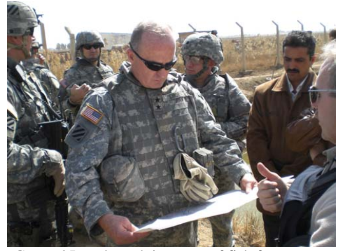
General Lynch studying map of fish farm areas.

Actions Requiring Decision: Col. James needs to decide how we will proceed in meeting General Lynch's request to have a meeting to discuss specific activities, funding sources and implementation issues for the Iskandariya Fish Farm Program and the Central Euphrates Farmers Market. We also need to finalize the details for the meeting with INMA, USAID and EPRT North Babil staff to decide how we can move forward on both these programs.