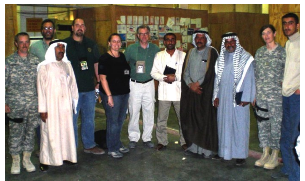
Meeting with Iraqis at FOB ISKAN

At one point, one of the Sheiks said, "The most important thing you can do for us is to get the Iraqi government to equitably allocate resources to our communities."