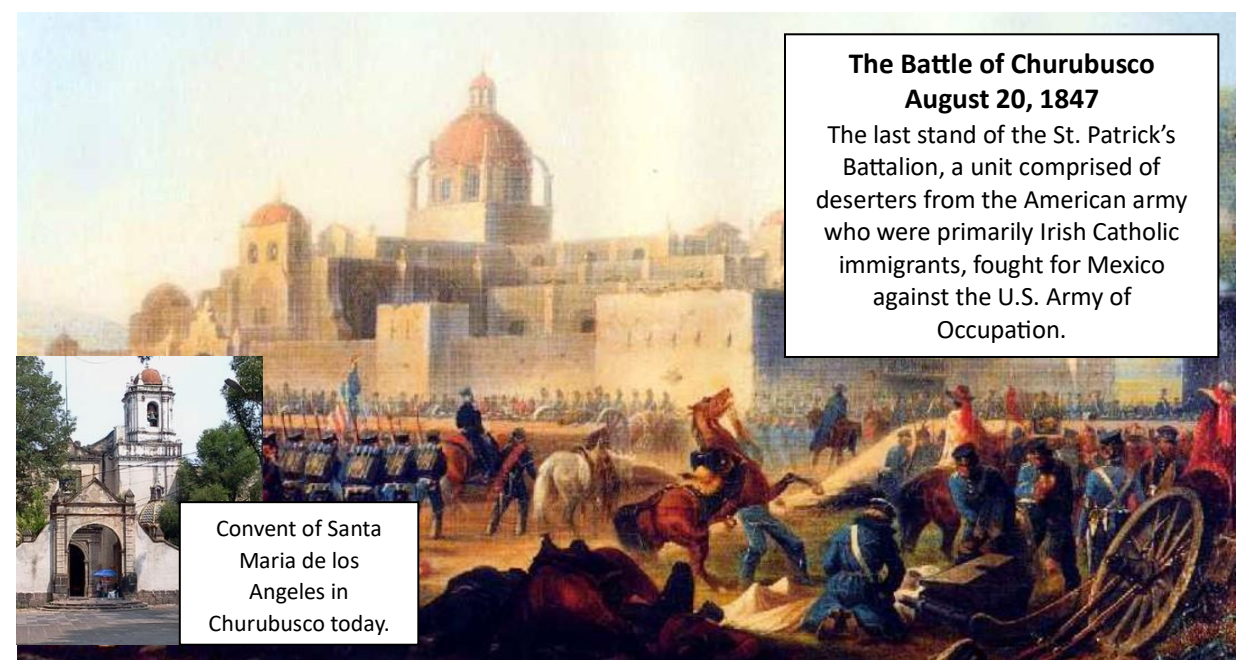
Saint Patrick's Battalion. (2024, February 28). In Wikipedia . <u>https://en.wikipedia.org/wiki/Saint_Patrick%27s_Battalion</u>