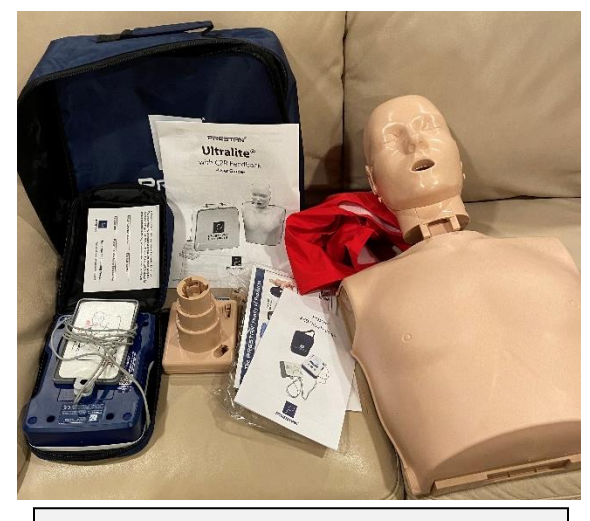
Training Equipment for AED Defibrillator and CPR Training